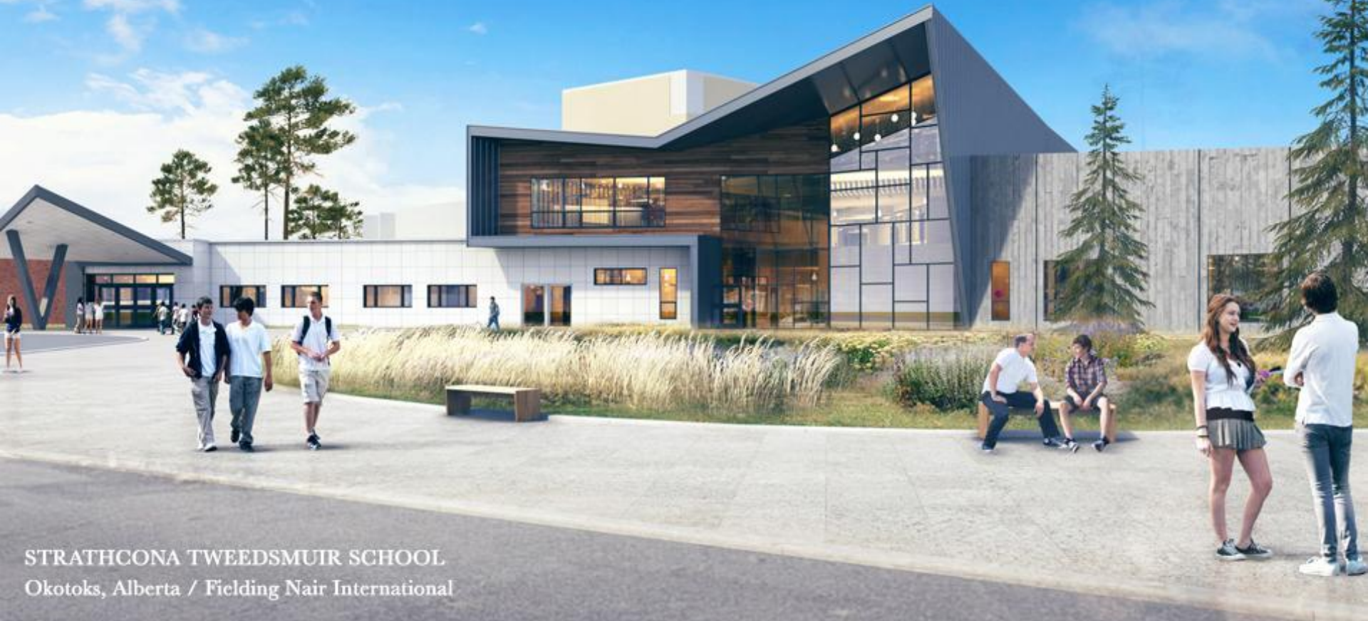
STRATHCONA TWEEDSMUIR SCHOOL Okotoks, Alberta / Fielding Nair International

Modern school facilities across Canada provide examples of inspiring spaces for learning & innovation.